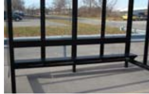
FULL LENGTH ALUMINUM BENCH WITH BACK REST