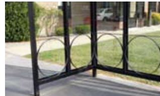
EASY DOES IT