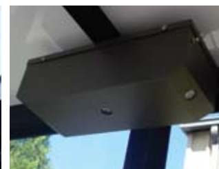
LED LIGHTS IN VANDAL-RESISTANT BOX