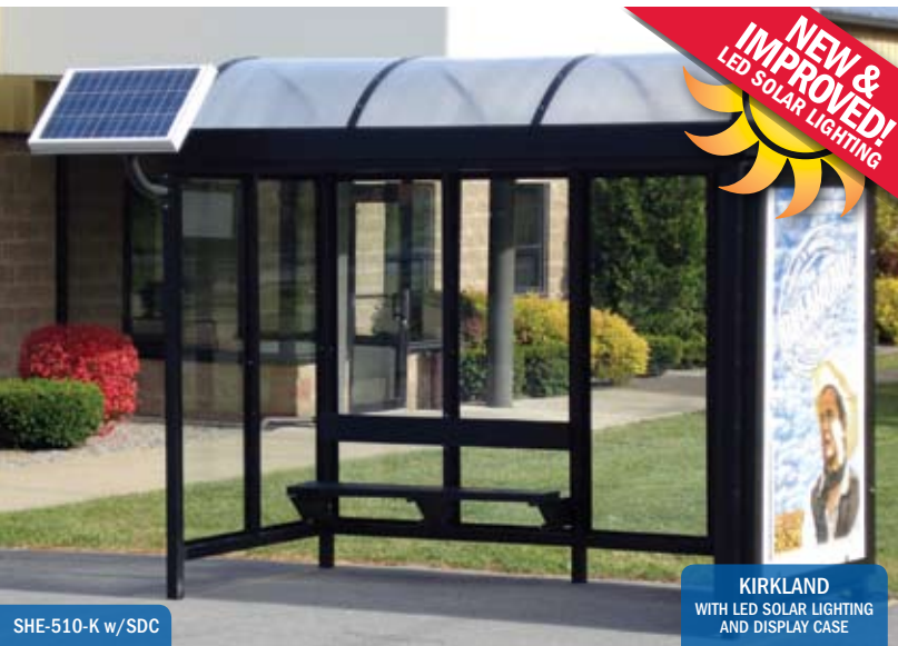
KIRKLAND WITH LED SOLAR LIGHTING AND DISPLAY CASE