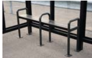
STEEL ANTI-VAGRANT BENCH