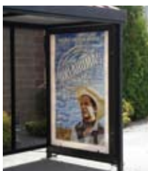
DISPLAY CASE INTERIOR