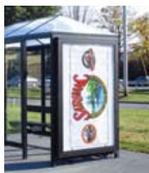
DISPLAY CASE EXTERIOR