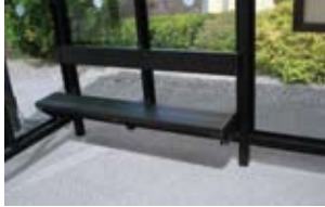
ADA ALUMINUM BENCH WITH BACK REST

Select the seating style and option that's right for you.