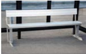
PEDESTAL ALUMINUM BENCH WITH BACK REST