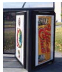
A-FRAME DISPLAY CASE